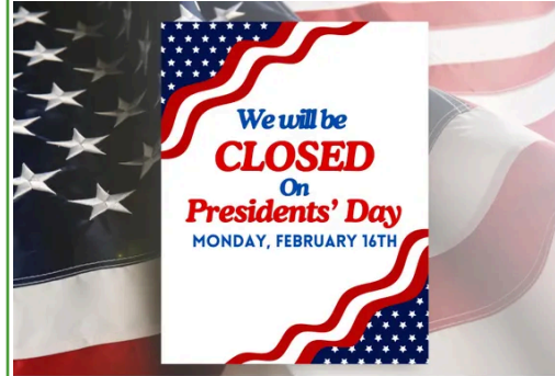
US LETTER · PRINTABLE